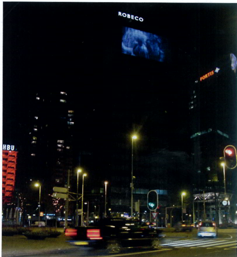
Guy Maddin and Isabella Rossellini, Send Me to the 'Lectric Chair, 2009, black-and-white film in Super 8 and 16 mm, 7 minutes. Installation view, Coolsingel and Blaak, Rotterdam.